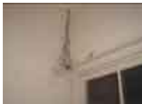
R. flavipes swarm

Because of their cryptic nature, structural infestations of subterranean termites are usually not visible. Most people become aware of an infestation when annual flights of winged termites (called alates) occur in structures. The alates of R. flavipes and R. virginicus are dark brown, while those of R. hageni are yellowish brown. Alates of R. flavipes are generally larger (approximately 0.4" long including wings) than those of R. virginicus or R. hageni (approximately 0.3" long). Alate wings of Reticulitermes species have two hardened and thickened veins that are visible along the entire front end, but lack the small hairs that are characteristic of the Formosan subterranean termite , Coptotermes formosanus Shiraki. After indoor flights, most alates are found dead near windows or in sinks and bath tubs - usually with their wings still attached.